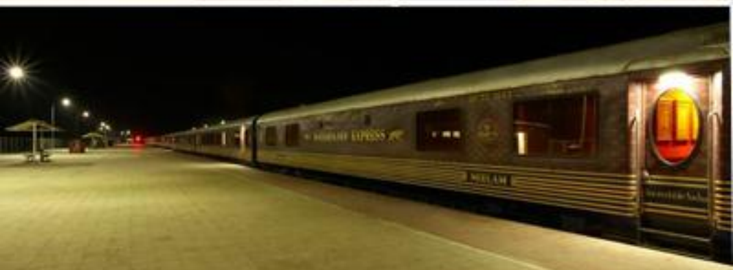
Outer Look of Train