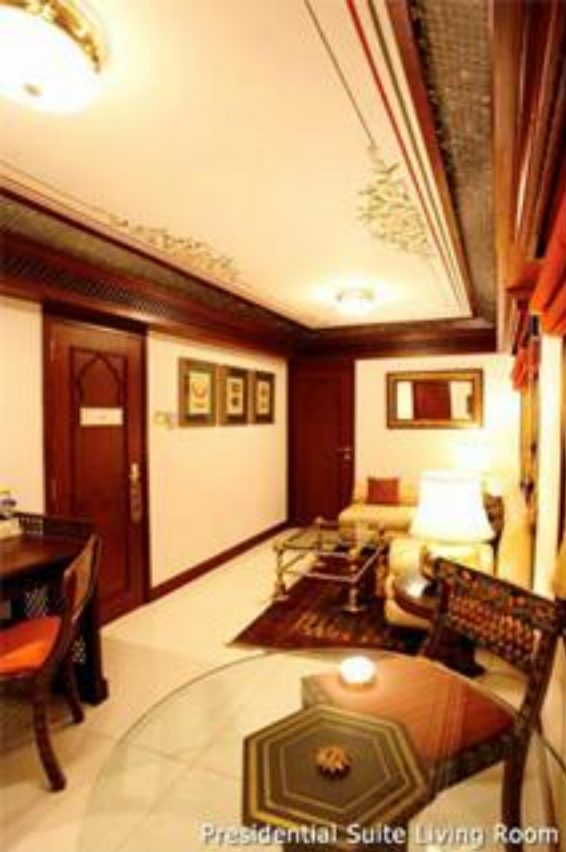
Presidential Suite Living Room